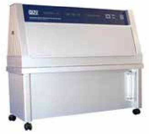
QUV® Accelerated Weathering Tester

This type of UVB light can initiate chemical reactions to occur in the coating that would normally not be possible under natural, real-world sunlight exposures. This testing has been proven to have poor correlation to natural weathering. It can cause failures in good-quality coatings that would not occur in natural sunlight, and false positives in coatings that contain lowquality pigmentation.