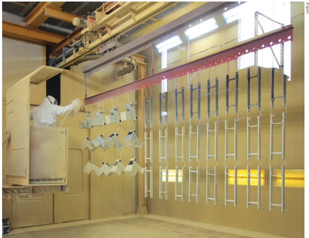
Figure 3: Manual primer application.

“The choice not to produce a full line, but only focus on specific products arose from Mascar's will to offer reliable, high tech, high quality, high productivity machinery in a very specific market niche.”