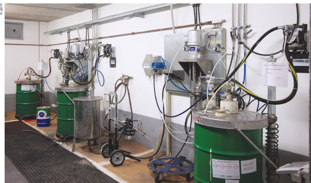
Figure 10: Mascar installed a control panel to manage the system and detect anomalies.