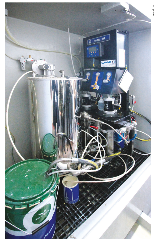
Figure 7: Mascar has chosen the GracoProMix 2KE dosing unit for the primer application stage.