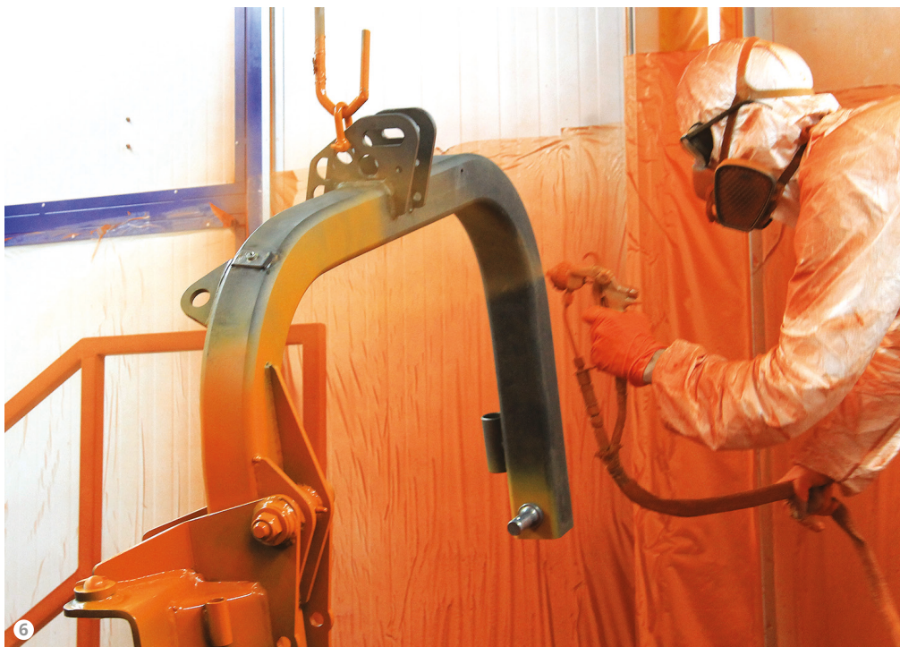
Figure 6: One of the two manual booths.

"The application equipment of the primer (Fig. 11) and enamel booths are symmetrical," says Benevelli. "Each booth features an EcoDose 2K electronic dosing system. The automatic stations' systems are equipped with a remote station, fibre-optic volumetric counters, and insulated devices with high and low pressure pumps, whereas the manual retouching stations feature standard EcoDose 2K systems with high and low pressure pumps. A PLC manages an EcoDose 2K for the automatic application process of each robot and an EcoDose 2K for each manual station."