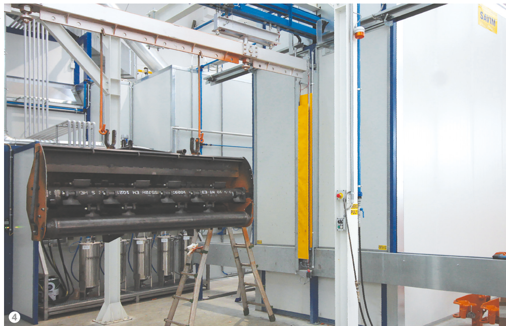
Figure 4: A component at the entrance of the pre-treatment booth.