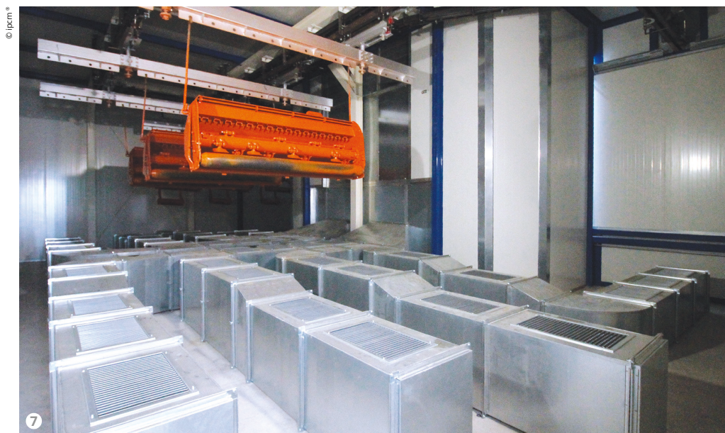
Figure 7: The curing stage in the direct fired furnace.

developed a flexible and modular system that combines an electrostatic application process with an automatic system for the dosing and mixing of 2K coatings through fibre-optic flow metres (Fig. 9). The coating management unit is equipped with three groups of lifts for the 200 kg-drums used for the storage of paints, level sensors, and Dürr circulation pumps for the primer and enamel. The remote coating management unit (Fig. 10) is located about 50 m of pipes away from the booths. Specific loading stations feed directly the process tanks of both the manual application stations and the insulated stations that contain the electrostatically charged pumping systems."