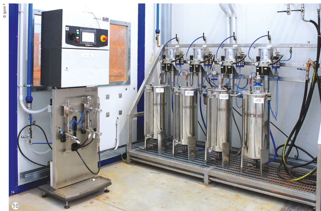
Figure 10: The coating management unit for manual station with Dürr pump.

"The four robots installed for Berti Macchine Agricole feature all three programming logics available: point-to-point, self-learning, and off-line, which is the main challenge in the field of industrial robotics of the last decade. In fact, the off-line programming method