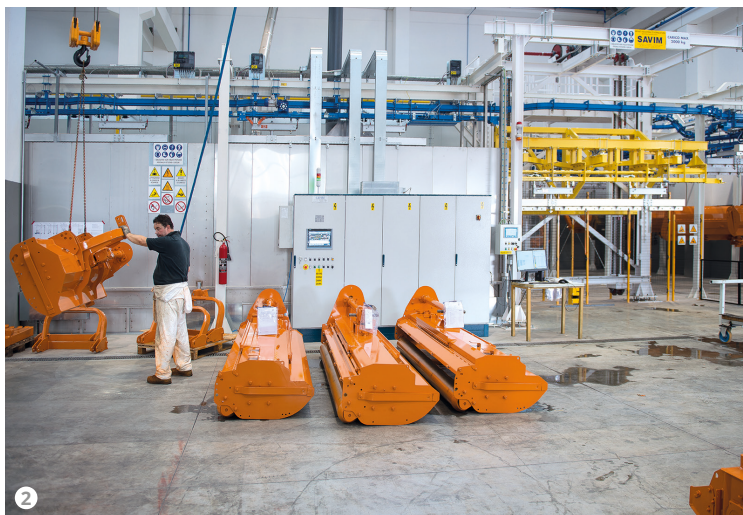
Figure 2: A bird's eye view of the new coating plant supplied by Savim (Arbizzano, Verona).