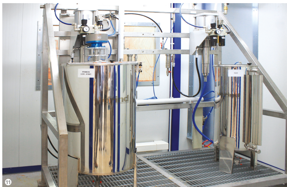
Figure 11: The feeding system of the primer application booth for manual station with Dürr pump.

"Gaiotto's robots, with all their technological systems, operate at the core of the coating process, interfacing with both Verind's application systems and Savim's plant systems," says Pesamosca. "Together with Verind, we developed an operating interface between the robots and the spraying