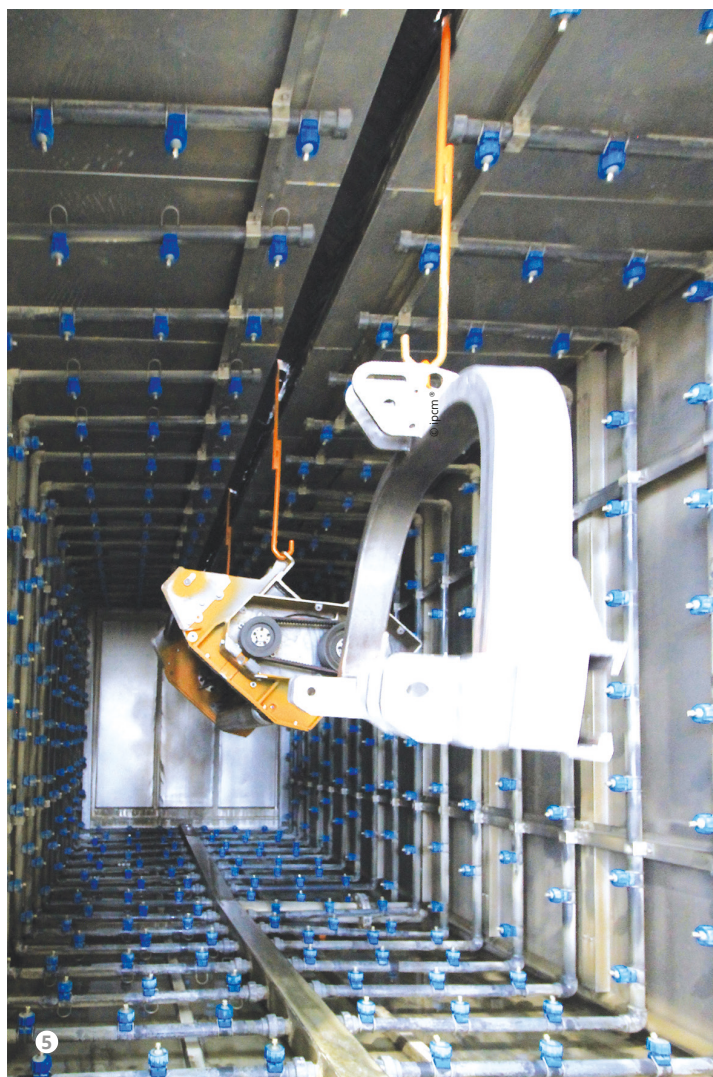
Figure 5: The 3-stage chemical pre-treatment process.

Savim chose to integrate these automatic booths with two manual ones (Fig. 6) to coat oversized workpieces, but also to perform accurate post-retouching operations on parts where particular masks may hinder uniform coverage by the robots and to treat the components that still require a solvent-based coating, accounting for 15% of production. The robots are equipped with electrostatic guns, whereas the manual booths perform a conventional application operation. The