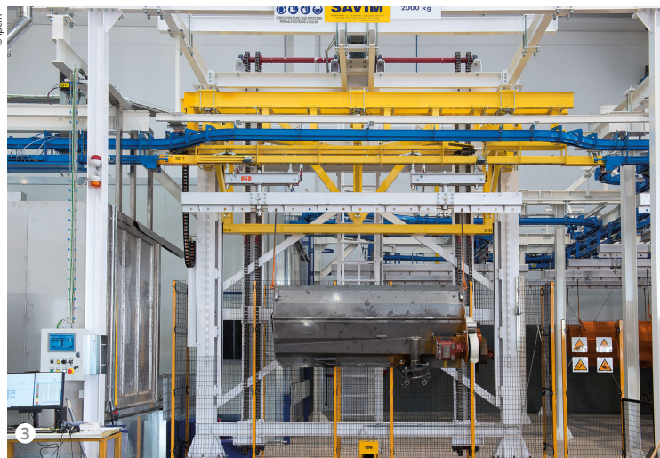
Figure 3: A detail of the plant.

to switch to water-based coatings," explains Filippo Berti.