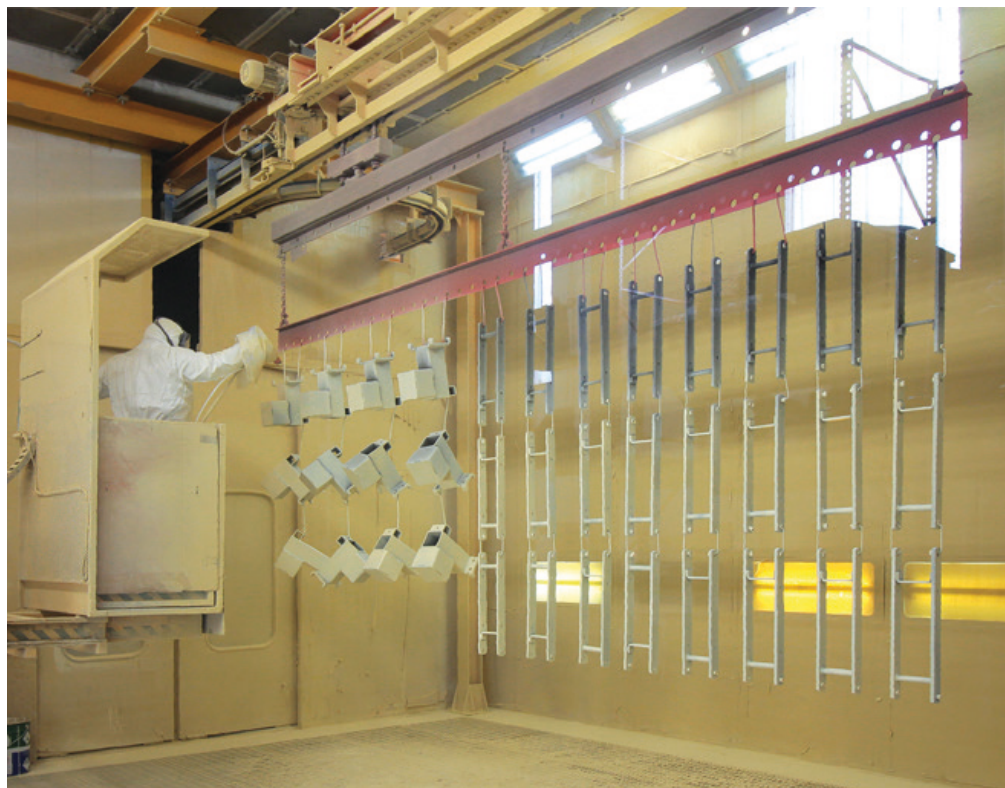
Figure 3: Manual primer application.

“The choice not to produce a full line, but only focus on specific products arose from Mascar's will to offer reliable, high tech, high quality, high productivity machinery in a very specific market niche.”