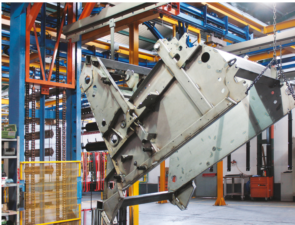
Figure 2: After machining and assembly, the parts are transferred to the coating department.

In order to meet these needs at best, in 2017 Mascar renovated its paintshop with the help of Graco, a world leader in the supply of fluid management systems and equipment (through Comaind, one of the Graco distributors in Italy), and Inver, a brand of the Sherwin-Williams Company, which supplies the company with last generation water-soluble two-component coatings.