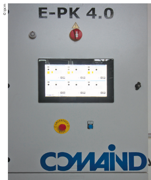
Figure 10: Mascar installed a control panel to manage the system and detect anomalies.