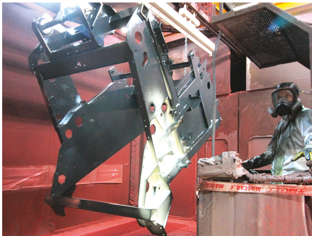
Figure 4: Manual top coat application.