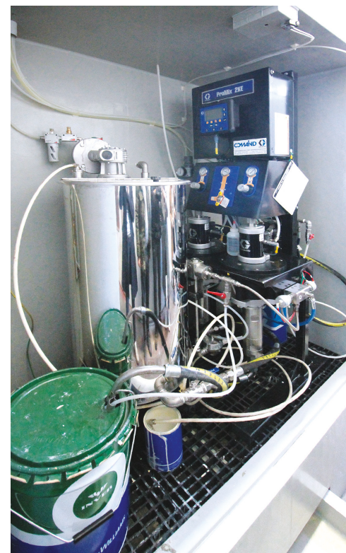
Figure 7: Mascar has chosen the GracoProMix 2KE dosing unit for the primer application stage.