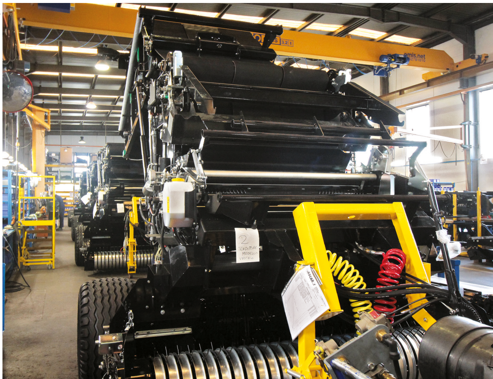
Figure 1: Balers are among Mascar's top products.