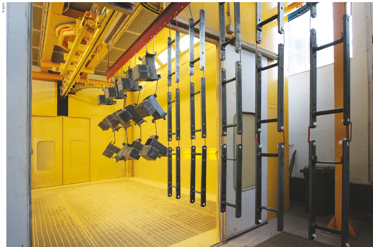
Figure 5: Workpieces exiting the coating booth, ready to be transferred to the polymerisation oven.

Mascar builds its different types of agricultural machines with different production cycles: round balers follow a fixed path, whereas for our seed drills we produce the individual components separately and we assemble them in different ways based on customer needs."