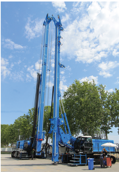
Testing in the area outside the production factories.