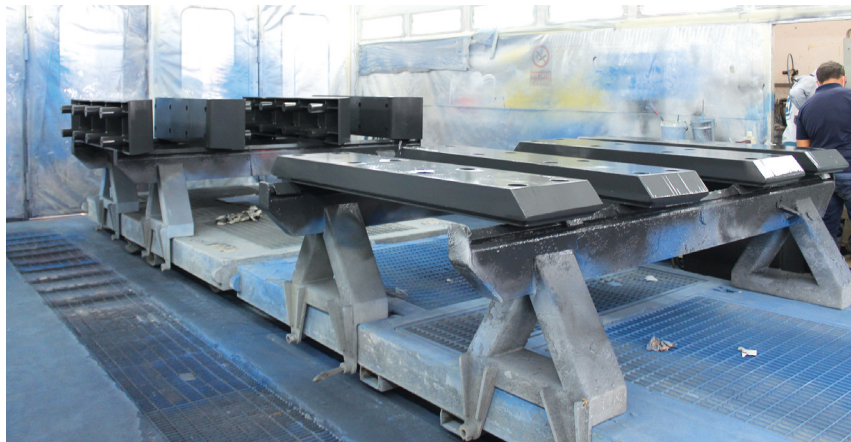
Primed parts waiting for the top coat application.