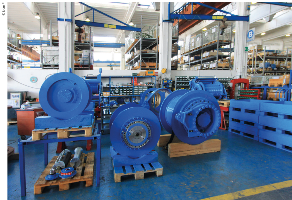
Some macro-components in the assembly area.