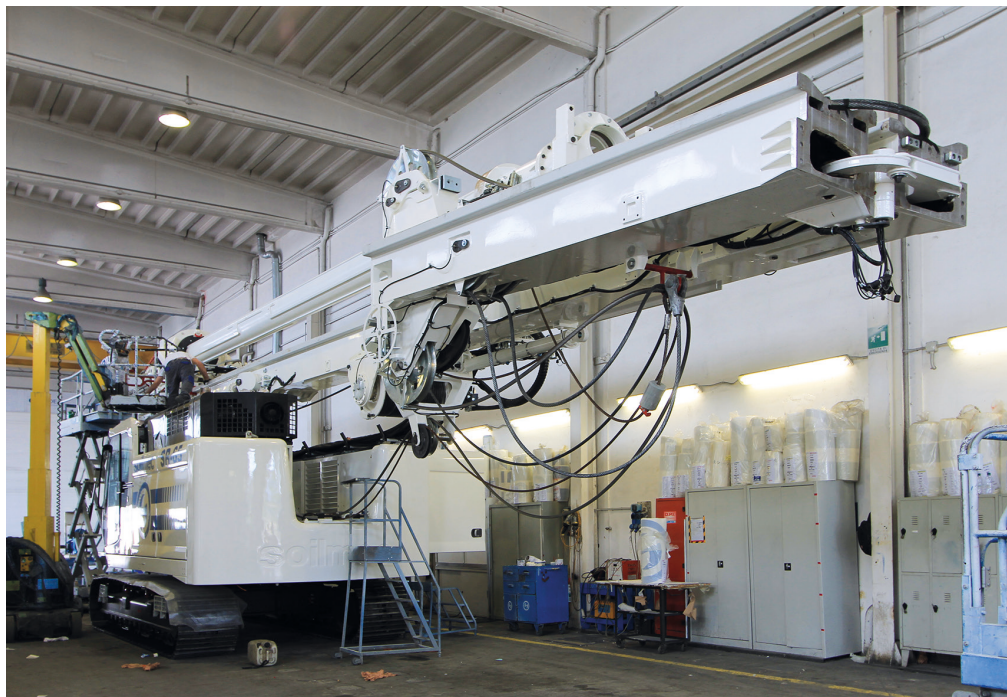
A machine during the manual touch-up phase.