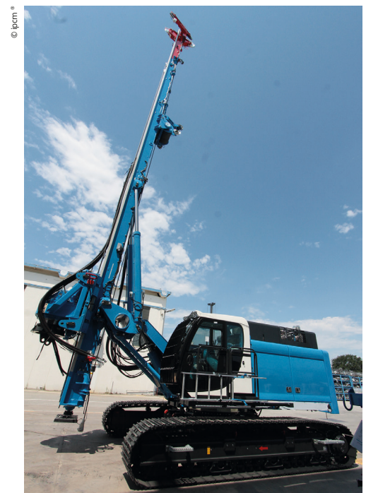
A Soilmec machine finished and ready for delivery.