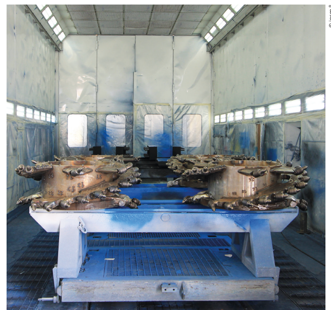
The inside of the coating booth.