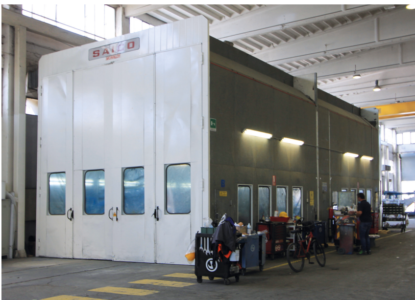
The coating booth.

"Our factory builds, on average, 150-200 systems per year, which are then distributed all over the world, particularly in North America, Europe, Australia, and China, where the latest Soilmec product series, that of hydromills with a very advanced technological level and a weight of at least 300 tonnes, is highly appreciated."