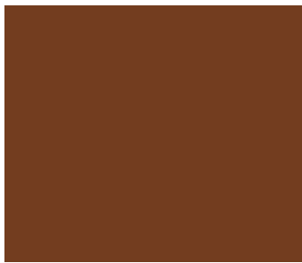
Worn Penny VDM2-80004