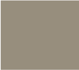
Champagne Topaz VHM2-80000