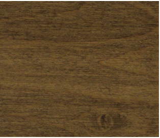
SB014 Chocolate Brownie