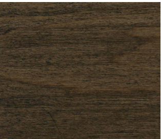
SB016 Black Forest