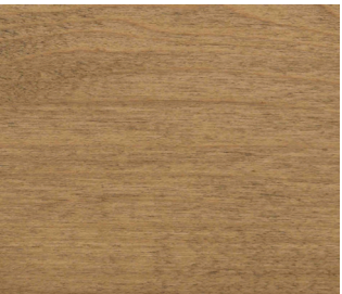
SB039 Soft Sand