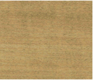
SB035 Sweet Honey