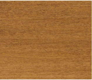
SB028 Warm Tan