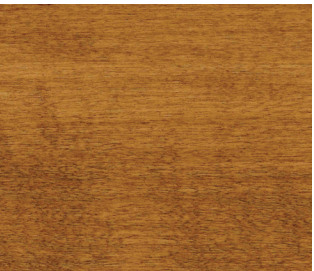
SB024 Golden Sunshine