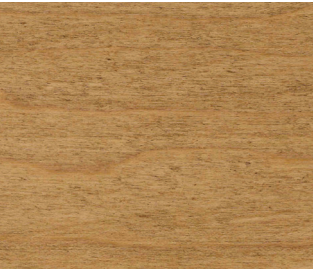
SB050 Tea with Milk