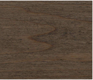
SB004 Warm Toffee