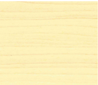
SB034 Natural Grain

Complete stain boxes are available. Contact your local Sherwin-Williams Industrial Wood representative to order one today.