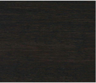
SB005 Winter Sky