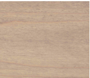
SB009 Warm Gray