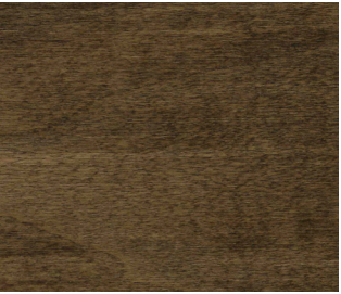
SB038 Perfect Brown

Due to the printing process, colors shown approximate the actual stain colors as closely as possible.