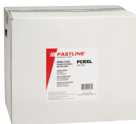
Reclaimed Wiping Cloths