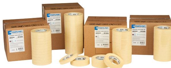
Performance Grade Masking Tape

Contact your local Sherwin-Williams sales representative for additional product information.