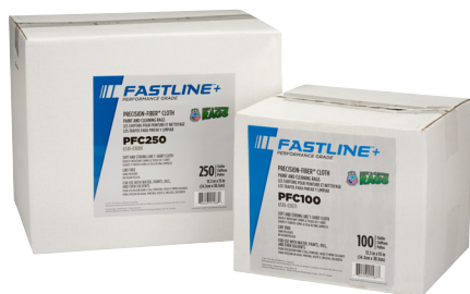
Precision-Fiber™ Wiping Cloths