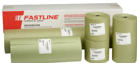
Greenshield Masking Paper