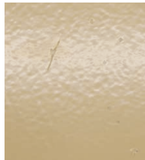
Under white light inspection pinholes are difficult to see.