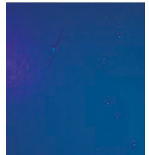
Under UV light inspection pinholes are easy to identify.