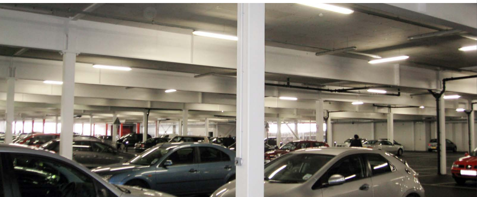
Typical supermarket car park interior steel. Many metres from potential external weathering and in a dry well ventilated environment. Assumes building is water tight.

If pools of water can collect at the base of columns for example via snow melt from cars, then the most suitable specification would be the epoxy system FP6. In fact for such conditions or for mechanical damage resistance, for example from shopping trolleys or car doors, it may be appropriate to use a combination specification of epoxy on the columns and either water based or solvent based thin film intumescent on the beams.