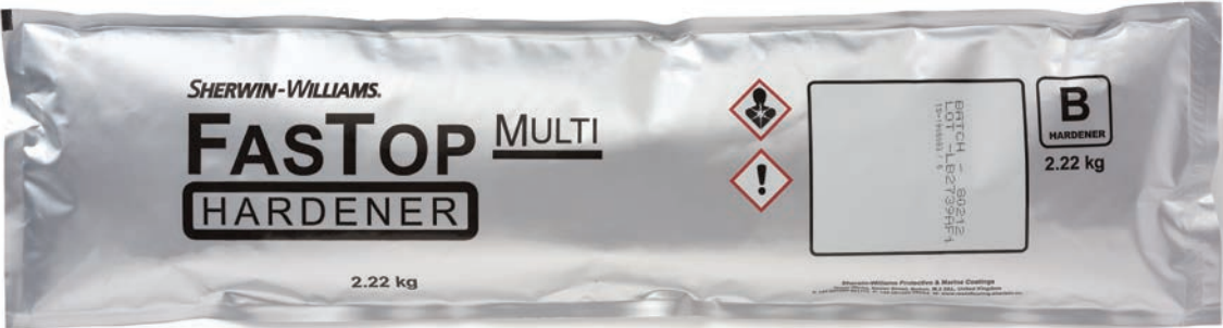
Part B Hardener