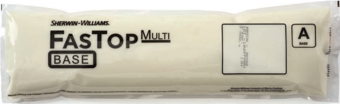
Part A Base