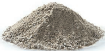
Part C Aggregates