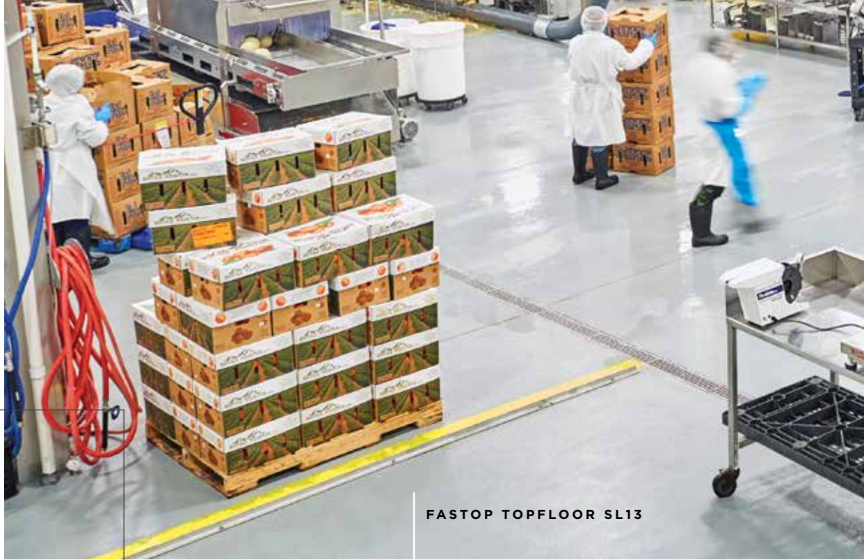
FASTOP TOPFLOOR SL13