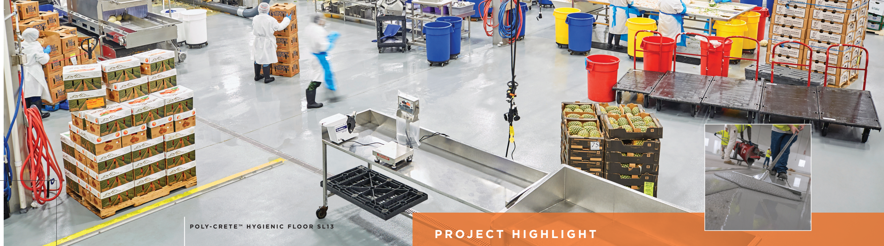
POLY-CRETE™ HYGIENIC FLOOR SL13